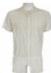
45th Birthday Party White Shirt With Rhinestones And Zipper Worn By Michael Jackson (2003)

White linen long-sleeve shirt with rhinestone buttons and straps around the hand cuffs that are accented with Swarovski crystals. Worn by Michael Jackson at his public 45th birthday party on August 30, 2003, at the Orpheum Theatre in LA. [Product Details...]