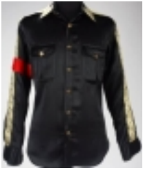
Black Satin Shirt With Braided Gold Striping (1990's)

Black long sleeve silk shirt with white arm band worn by Michael in the long version of the Black or White video. [Product Details...]