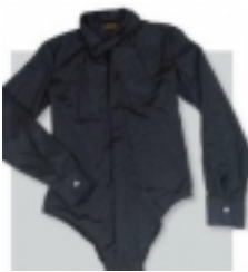
Black Silk Bodysuit Worn By Michael (1970s)

Military style black cotton shirt with a red arm band and four front cargo pockets. The chest pockets have red, black and white ribbon accents. Date unknown. [Product Details...]