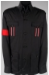
Black Shirt With Cargo Pockets (Date Unknown)