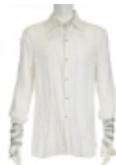
45th Birthday Party White Long-Sleeve Shirt With Rhinestone Buttons Worn By Michael Jackson (2003)

Have an MJ personal belonging not on our site? Add it here!Â