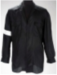
Black Or White Video Black Long Sleeve Shirt (1991)

Black long sleeve silk shirt with white arm band worn by Michael in the long version of the Black or White video. [Product Details...]