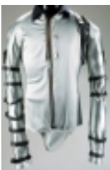
BAD Tour Silver Spandex Bodysuit (1987)

Silver shirt worn by Michael during the Bad Tour Japan 1987. [Product Details...]