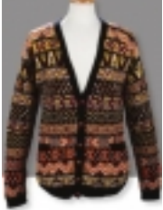
BAD Era Multicoloured Cardigan (1987)

Aztec print cotton shirt with zip closure worn by Michael on TV show appearances such as "Hellzapoppin" and publicity photoshoots. The shirt was used for the production of a swatch card in Panini's 2011 Trading Card release. [Product Details...]