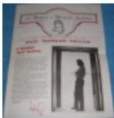
World Of Michael Jackson Newsletter #7 (Fall 1989)

Six page fold out B&W newsletter. Cover is "A Message From Michael" with photo of Michael performing Smooth Criminal from the 1988 Tour. "World of MJ" was the "official" MJ fan club from 1986-90. [Product Details...]