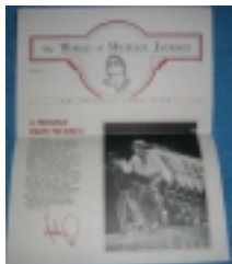
World Of Michael Jackson Newsletter #6 (Early Summer 1989)

Six page fold out glossy color newsletter. Cover is "Special 'BAD Tour' Edition!/A Message From Michael." Photo of Michael live from the 1987 BAD Tour in white shirt. "World of MJ" was the "official" MJ fan club from 1986-90. [Product Details...]