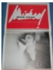
Michael Jackson International Fan Club Vol. 1, #1 (Late 1992)

Have an MJ memorabilia item not on our site? Add it here!