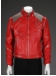
Beat It Leather Jacket Signed By Michael

A red leather J. Palo Michael Jackson 'Beat It' style jacket. Signed by Michael on the right chest. [Product Details...]