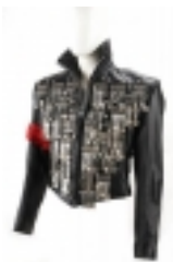
Black Leather Jacket With Miniature Utensils (1990's)