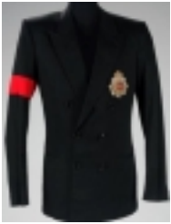
Black Double Breasted Jacket (1990's)

Black crop jacket with white textured floral pattern. There is a handwritten label reading "HAV0009 M.J.J." and a Western Costume label reading "Michael Jackson". Probably from the 1990's. [Product Details...]