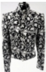
Black Crop Jacket With White Floral Pattern (1990's)

Unique 'Beat It' leather jacket worn by Michael during the video shot. It comes with his personal letter. [Product Details...]