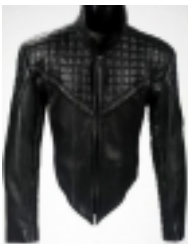
Black Leather Jacket (1990's)