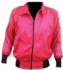
Beat It Pink Satin Jacket Worn By Michael (1990s)

A red leather J. Palo Michael Jackson 'Beat It' style jacket. Signed by Michael on the right chest. [Product Details...]