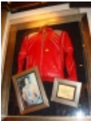
Beat It Red Leather Zipped Jacket Worn By Michael In The Video (USA)

Custom made pink satin jacket made for Michael in the 1990's. According to "Gotta Have It", this was to be used during "Beat It". [Product Details...]