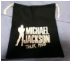
Bad Tour Japan '88 Official Black Cotton Drawstring Bag (Japan)

2009 London's Exhibition Official BAD black buckle hand bag. [Product Details...]