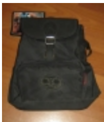
HIStory Official Black Backpack (Europe)

Black Bravado Tote Bag with Dangerous Album Photo on front and "King Of Pop 50 O2 London" on back. [Product Details...]