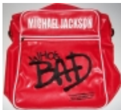
"Who's Bad" Official Red Vinyl Bag (UK)

Have a Michael Jackson purse, handbag, or tote bag not on our site? Add it here!