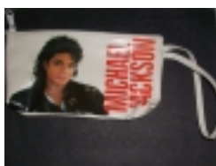
BAD LP Cover Official Pencil Case (Holland)

Red Vinyl Bag reads "Michael Jackson Who's Bad London 50 O2." Sold exclusively by Bravado UK. [Product Details...]