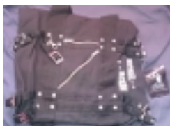
BAD Official Bravado Canvas King Of Pop CO2 London Buckle Bag (UK)

8 1/2"x4 3/4" white with "LP cover" bust pose and "MJ" written in orange on left. 1988 Triumph/Winterland/Verkerke (Holland) [Product Details...]