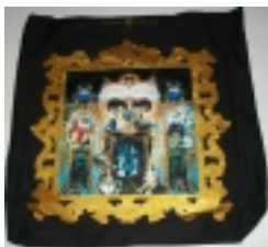
Dangerous LP Cover Official Black Tote Bag (UK)

Small 7 3/4"x9 1/4" black totebag with "Captain EO" logo. [Product Details...]