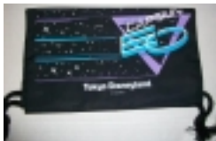
Captain EO Totebag From Tokyo Disneyland (Japan)

Japanese Bad Tour '88 Official black drawstring bag. [Product Details...]