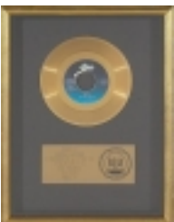
Beat It RIAA Gold Record For The Sale Of 1 Million Copies Of The 7" Single In USA

RIAA Gold Award presented to Epic Records to commemorate the sale of more than 500,000 copies of the single Beat It. [Product Details...]