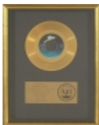
Billie Jean RIAA Gold Record Award For The Sale Of 1 Million Copies Of The 7" Single In USA

RIAA Gold record award presented to Michael Jackson to commemorate the sale of more than one million copies of the Epic Records single "Billie Jean." [Product Details...]