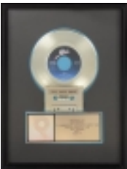
Beat It RIAA Gold Award For The Sale Of 500,000 Copies Of The Single In USA #2

RIAA award for the single Beat It presented to Epic Records. [Product Details...]