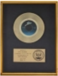
Beat It RIAA Gold Award For The Sale Of 500,000 Copies Of The Single In The USA

RIAA Multi Platinum Award for the sale of 3 million copies of the BAD album on LP and cassette in the USA. Presented to Sony exec Brad Hanson in 1987. [Product Details...]