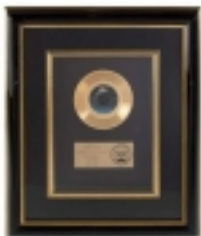
Billie Jean Gold RIAA Award *Presented To Michael* (1983)

RIAA Gold record award presented to Michael Jackson to commemorate the sale of more than one million copies of the Epic Records single "Billie Jean." [Product Details...]