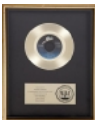
Billie Jean RIAA Platinum Award For The Sale Of 1,000,000 Copies Of The Single In USA

"Billie Jean" RIIA Platinum Single award for the sale of 1 million copies of the 7" single. Presented to Michael Jackson . [Product Details...]