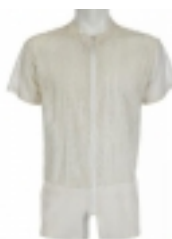
45th Birthday Party White Shirt With Rhinestones And Zipper Worn By Michael Jackson (2003)

White linen long-sleeve shirt with rhinestone buttons and straps around the hand cuffs that are accented with Swarovski crystals. Worn by Michael Jackson at his public 45th birthday party on August 30, 2003, at the Orpheum Theatre in LA. [Product Details...]