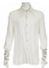
45th Birthday Party White Long-Sleeve Shirt With Rhinestone Buttons Worn By Michael Jackson (2003)

Have an MJ personal belonging not on our site? Add it here!Â