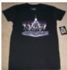
J5 Collection "Starfighter" Official Fashion Crew T-Shirt (USA)

Part of the "Official Merchandise" J5 Collection line. These high quality fashion shirts were made for upper tier retail shops in metros such as greater Los Angeles. Each includes custom "The J5 Collection" tag.