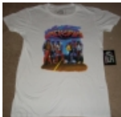
J5 Collection "Spacestreet" Official Fashion Crew T-Shirt (USA)

Part of the "Official Merchandise" J5 Collection line. These high quality fashion shirts were made for upper tier retail shops in metros such as greater Los Angeles. Each includes custom "The J5 Collection" tag.