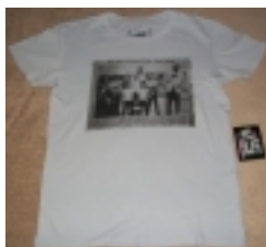
J5 Collection "Talent Show" Official Fashion Crew T-Shirt (USA)

Part of the "Official Merchandise" J5 Collection line. These high quality fashion shirts were made for upper tier retail shops in metros such as greater Los Angeles. Each includes custom "The J5 Collection" tag.