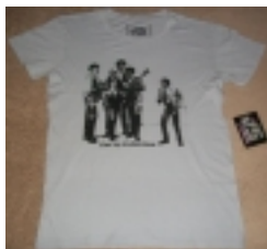
J5 Collection "60's" Official Fashion Crew T-Shirt (USA)

Have an MJ shirt not on our site? Add it here!