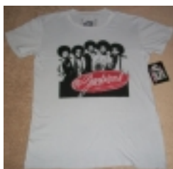
J5 Collection "Afros" Official Fashion Crew T-Shirt (USA)

Part of the "Official Merchandise" J5 Collection line. These high quality fashion shirts were made for upper tier retail shops in metros such as greater Los Angeles. Each includes custom "The J5 Collection" tag.