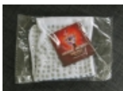
Immortal World Tour Cirque Du Soleil Glove (Japan)

German promotional white glove with BAD logo in red. [Product Details...]