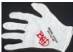
BAD World Tour '88 Promo Glove (Germany)

Have a Michael Jackson glove or clothing accessory not on our site? Add it here!