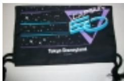
Captain EO Totebag From Tokyo Disneyland (Japan)

Japanese Bad Tour '88 Official black drawstring bag. [Product Details...]