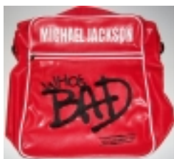
"Who's Bad" Official Red Vinyl Bag (UK)

Have a Michael Jackson purse, handbag, or tote bag not on our site? Add it here!