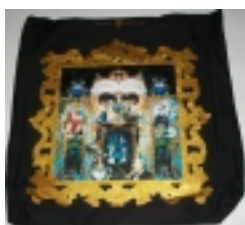
Dangerous LP Cover Official Black Tote Bag (UK)

Small 7 3/4"x9 1/4" black totebag with "Captain EO" logo. [Product Details...]