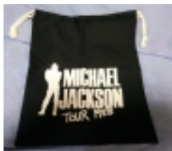
Bad Tour Japan '88 Official Black Cotton Drawstring Bag (Japan)

2009 London's Exhibition Official BAD black buckle hand bag. [Product Details...]