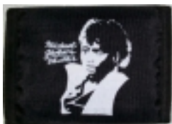
Michael Jackson "Thriller" (LP Cover) Bootleg Nylon Wallet *Black & White* (USA)

Have a Michael Jackson wallet or other clothing accessory not on our site? Add it here!