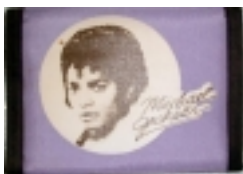
Michael Jackson "Thriller" (LP Cover) Bootleg Nylon Wallet *Light Purple With Black* (USA)

5"x3 1/2" brown with black nylon wallet with Thriller LP cover in a white circle and reads "Michael Jackson". With velcro closures. 1983 bootleg (made in Taiwan for US distribution). [Product Details...]