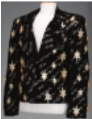
BAD Era Black Electric Jacket (1987)

Red wool blend jacket with red lamé lining and completely covered in red bugle beads with an elaborate gold seed beaded rope design with matching cuffs and epaulets. [Product Details...]