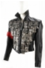
Black Leather Jacket With Miniature Utensils (1990's)