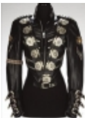
BAD Era Black Leather Jacket (1987)

Black jacket made of suede with silver printed striping and plastic starbursts that light up. Michael wore this jacket during his 1987 BAD tour in Japan. [Product Details...]