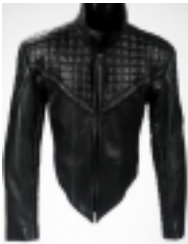
Black Leather Jacket (1990's)