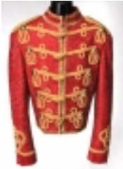
American Music Awards Red Crystal Jacket (1984)