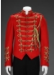
American Music Awards Custom *Prototype* Jacket (1984)